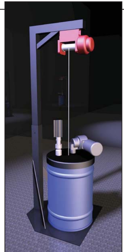
85 Gallon Agitated Drum Lift