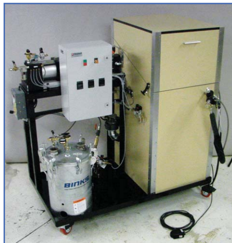
Custom heated resin system on cart