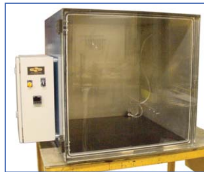
VC-30 Vacuum Chamber