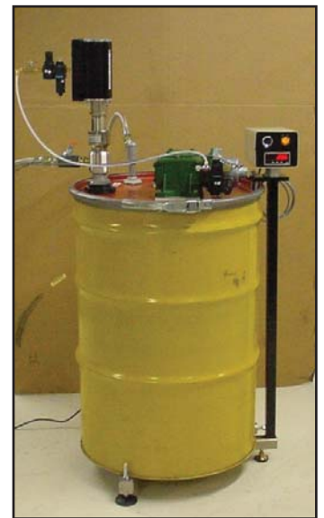
85 Gallon Agitated Drum