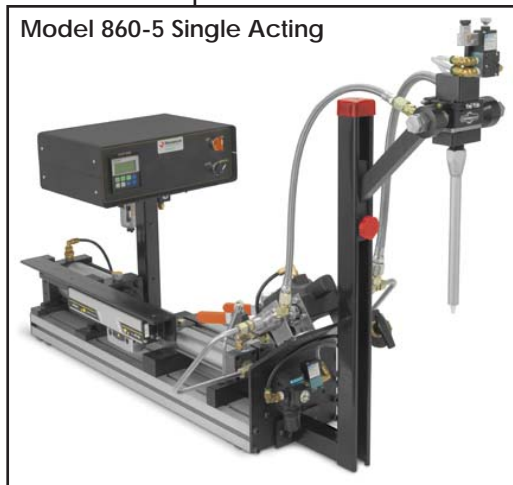
Model 860-5 Single Acting