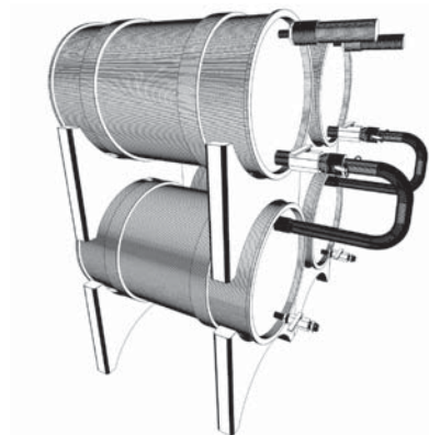
55 Gallon Cascade Assembly